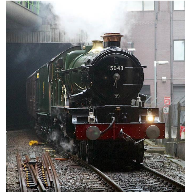
5043 Earl of Mount Edgumbe at Snow Hill Station, Birmingham

670 Warwick Road Tyseley Birmingham B11 2HL