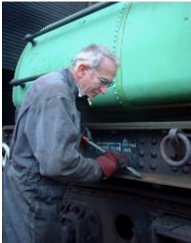
Above and top right: Volunteers undertake a variety of tasks at Tyseley

Funds raised by VTS are donated to restoration and site projects.