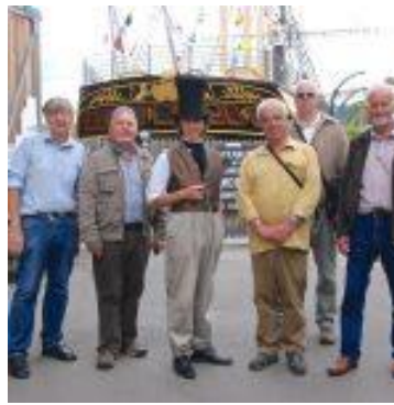
Friends meet-up at the SS Great Britain

Cheques should be made payable to: FRIENDS OF VINTAGE TRAINS