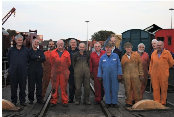
Meet one of the teams Some members of the Thursday night volunteer team at Tyseley

Why not check out the Vintage Trains website for all the latest information, including any forthcoming railtours: