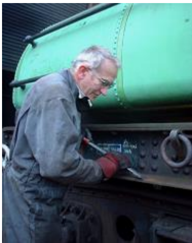
Above and far right Volunteers undertake a variety of tasks

Funds raised by the Friends are donated to restoration and site projects and used for the benefit of members of the Friends by, for example, offering social events to the members.