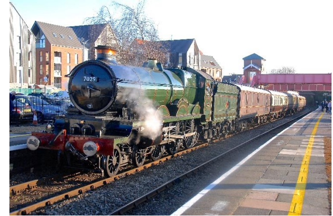
7029 Clun Castle at Stratford-upon-Avon

670 Warwick Road Tyseley Birmingham B11 2HL