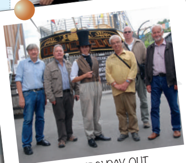
MEMBERS' DAY OUT AUG 2018