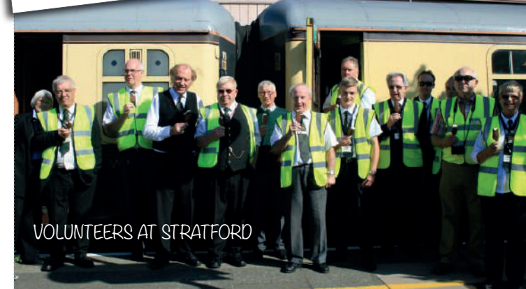
VOLUNTEERS AT STRATFORD