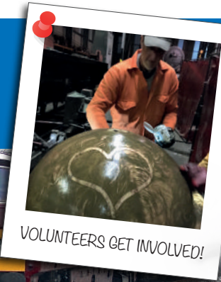
VOLUNTEERS GET INVOLVED!