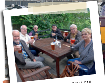
CHEERS FROM LLANGOLLEN!

If you prefer to pay by bank transfer please complete the Contact Us form on the Friends' website and you will be contacted with the bank details.