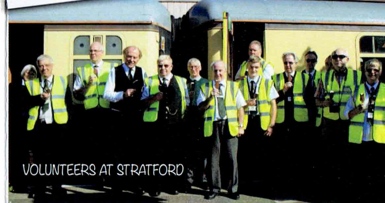
VOLUNTEERS AT STRATFORD