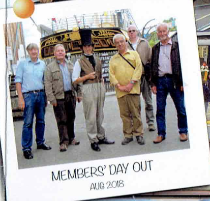
MEMBERS' DAY OUT AUG 2018