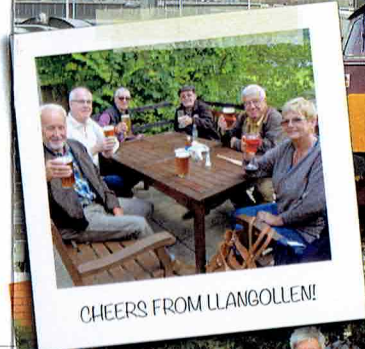
CHEERS FROM LLANGOLLEN!